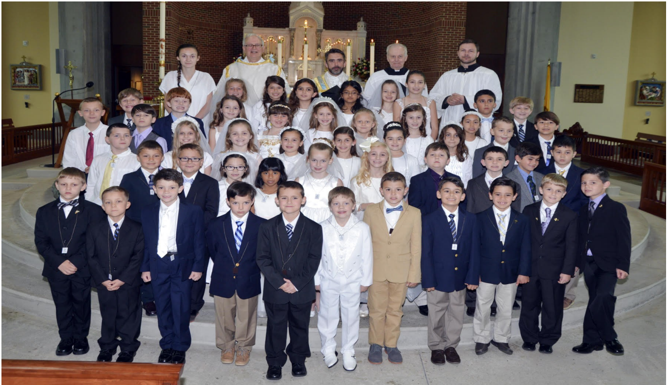
First Communion 2015