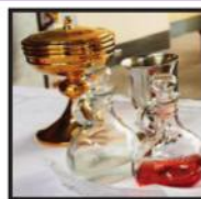
bread & wine $20