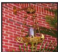
sanctuary lamp $20

Prayerfully consider donating the following: