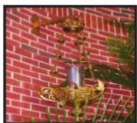
sanctuary lamp $20