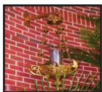
sanctuary lamp $20

Prayerfully consider donating the following: