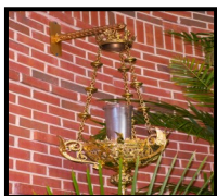
sanctuary lamp $20

Prayerfully consider donating the following: