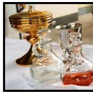
bread & wine $20