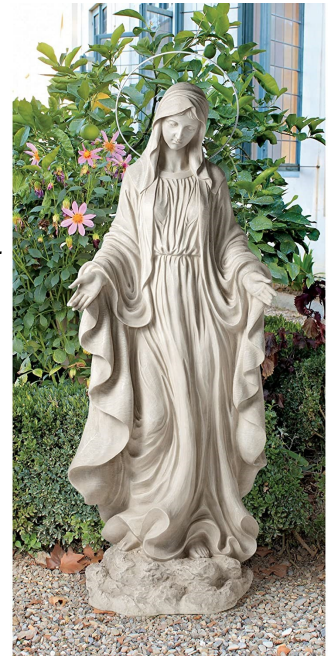
a new statue being installed and blessed at the parish school on 8 September as a gift from the Catholic Identity Committee

“Thy birth, O Virgin Mother of God, heralded joy to all the world. For from thou hast risen the Sun of justice, Christ our God. Destroying the curse, He gave blessing; and damning death, He bestowed on us life everlasting. Blessed art thou among women and blessed is the fruit of thy womb.” (from The Divine Office - Matins (Morning Prayer))