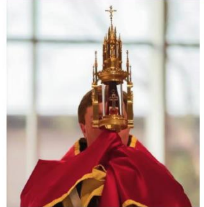
POP has a relic of the true cross