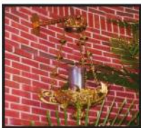
sanctuary lamp $20

Prayerfully consider donating the following: