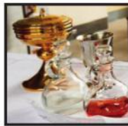
bread & wine $20