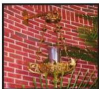
sanctuary lamp $20