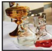
bread & wine $20